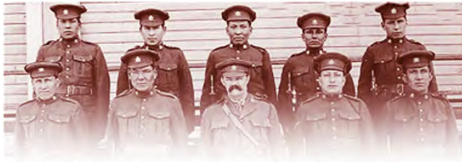
Métis at Sarcée Camp — Canadian forestry corps

http://www.veterans.gc.ca/pdf/cr/pi-sheets/Aboriginal-pi-e.pdf